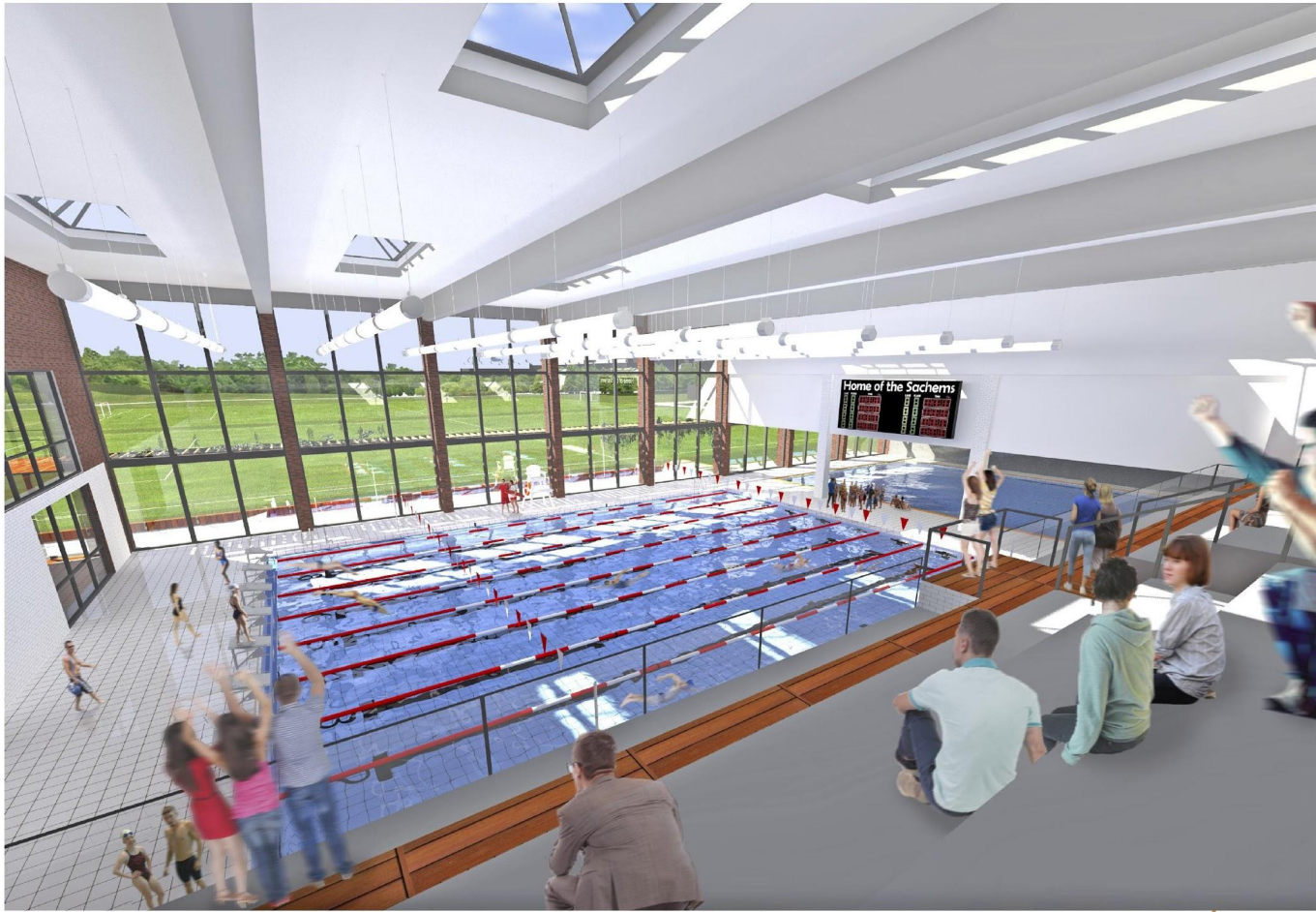
Winchester Pool View from Spectator Stand